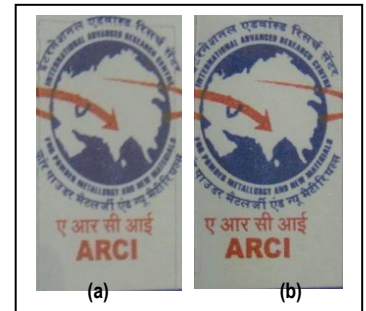
Photograph of object when viewed through (a) uncoated and (b) AR coated BSG substrate